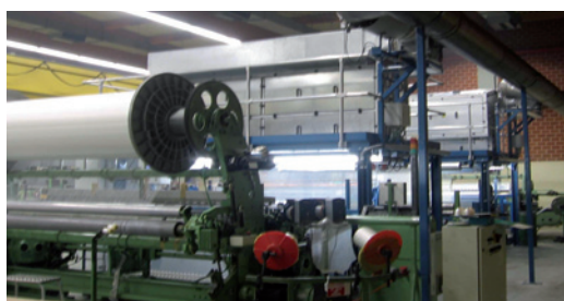
IR vertical dryer

MES master ® ... more than plant relocation