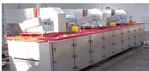
Combined IR/convection dryer in sectional design